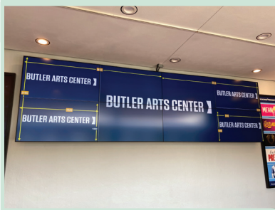
LARGE BOX OFFICE LOBBY