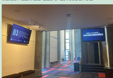
MAIN LEVEL LEFT ENTRANCE